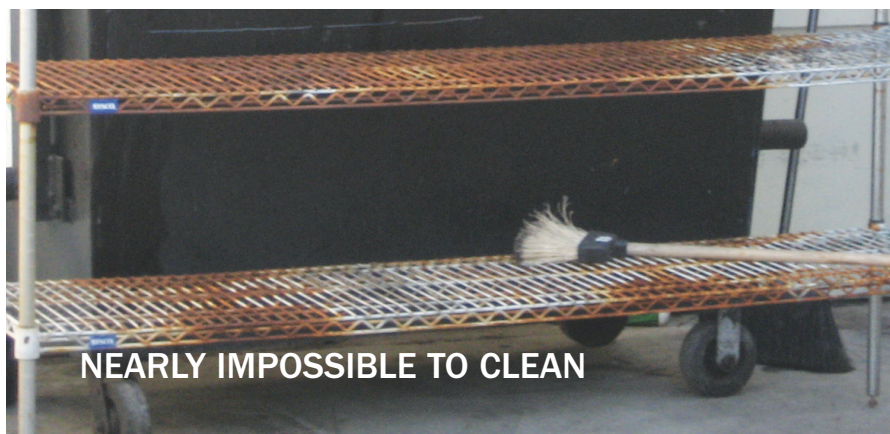
NEARLY IMPOSSIBLE TO CLEAN