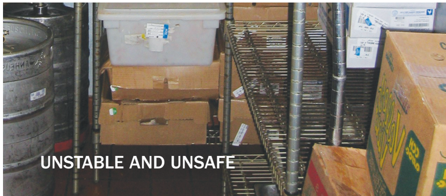
UNSTABLE AND UNSAFE