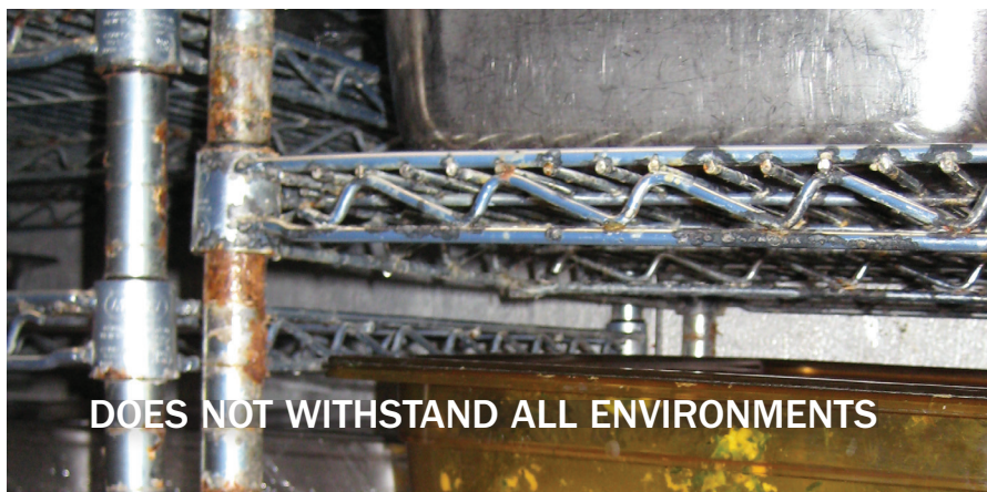
DOES NOT WITHSTAND ALL ENVIRONMENTS