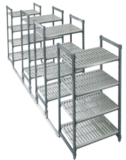
High Density Unit