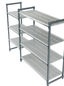
Starter and Add-On Unit