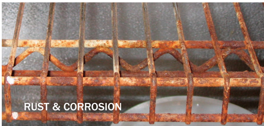
RUST & CORROSION